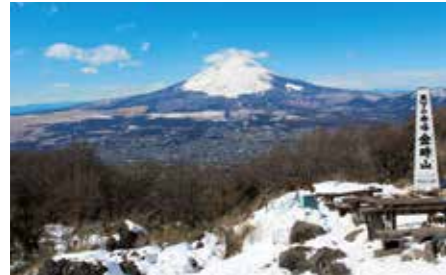
001 Mt. Kintoki (Hakone Town/Minamiasahigara City, Kanagawa Prefecture; Oyama Town, Shizuoka Prefecture)

Hakone has long been a stopover town where many travelers have visited while traveling along the Tokaido Road. This area is bustling with many tourists throughout the year thanks to its excellent landscapes such as Lake Ashinoko, Sengokujara, and Owakudani Valley where fumarole phenomena are still present, as well as its many hot springs.