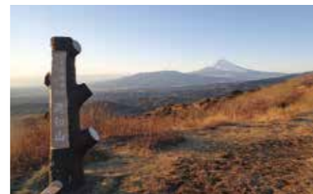
099 Izu Skyline Mt. Takichi Vantage point (Kannami Town/Atami City, Shizuoka Prefecture)