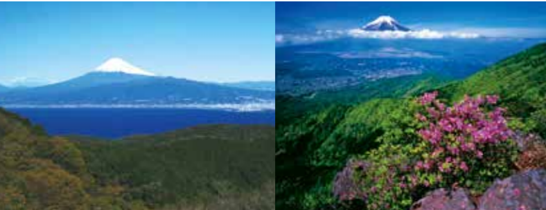
088 Darumayama Plateau [Mt. Daruma] (Izu City, Shizuoka Prefecture) 019 Mt. Shakushi (Oshino Village/Fujiyoshida City, Yamanashi Prefecture) 002 Mt. Myoujin [Myōjingatake] (Hakone Town/Minamishigara City, Kanagawa Prefecture)