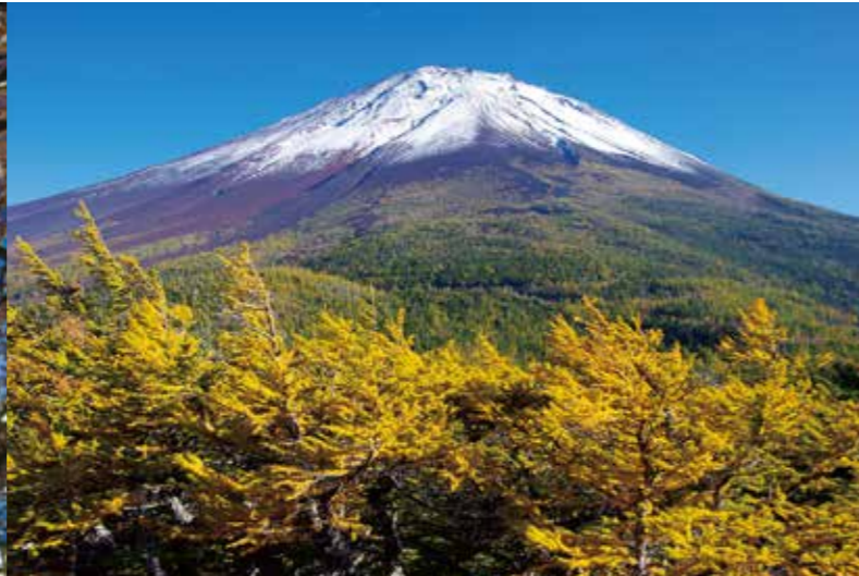
035 Oniwa/Okuniwa (Narusawa Village, Yamanashi Prefecture)