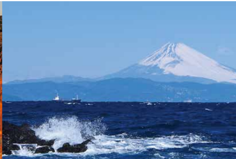
103 Mantate beach [Mantatehama] (Oshima Town, Tokyo)