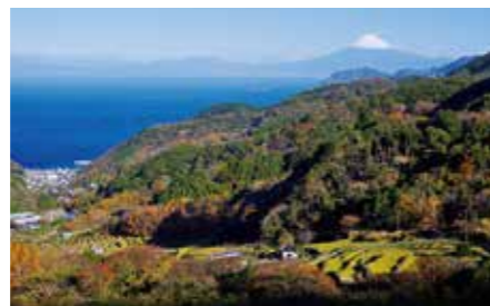
094 Ishibu Tanada (terraced paddies) (Matsuzaki Town, Shizuoka Prefecture)