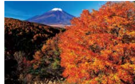
021 Nijūmagari Pass (Oshino Village, Yamanashi Prefecture)