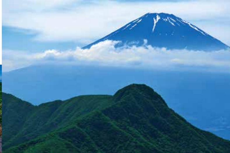
002 Mt. Myoujin [Myōjingatake] (Hakone Town/Minamishigara City, Kanagawa Prefecture)