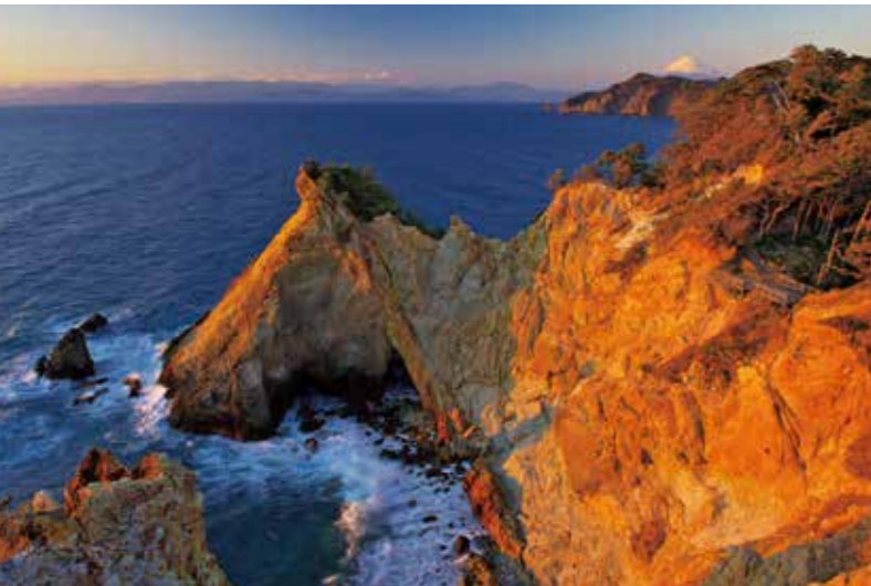
097 Cape Kogane [Koganezaki] (Nishiizu Town, Shizuoka Prefecture)