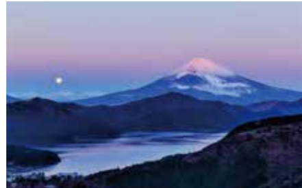
009 Daikanzan Vantage point (Hakone Town/Yugawara Town, Kanagawa Prefecture)