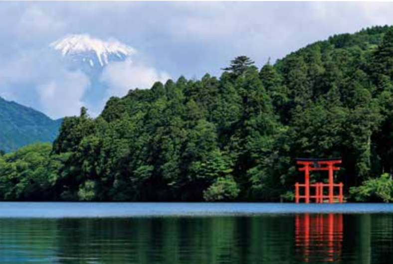
007 Motohakone lakeside path, Lake Ashi (Hakone Town, Kanagawa Prefecture)