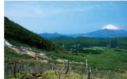
004 Ōwakudani (valley) (Hakone Town, Kanagawa Prefecture)