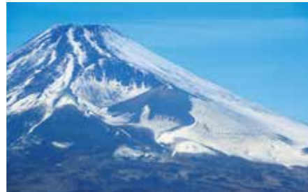
085 Fujimi-dai (viewpoint), Mt. Echizen (Susono City/Fuji City, Shizuoka Prefecture)