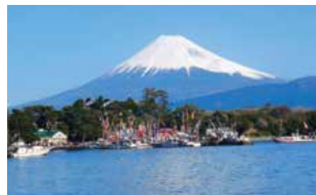
057 Cape Ōse (Ōsezaki) (Numazu City, Shizuoka Prefecture)

The Izu Peninsula was created when islands and submarine volcanoes southern ocean moved northward on the Philippine Sea Plate, colliding with mainland. It was certified as a UNESCO World Geopark in April 2018 for its highly appreciated geological resources such as the varied coastline and the gentle Amagi Mountain Range.