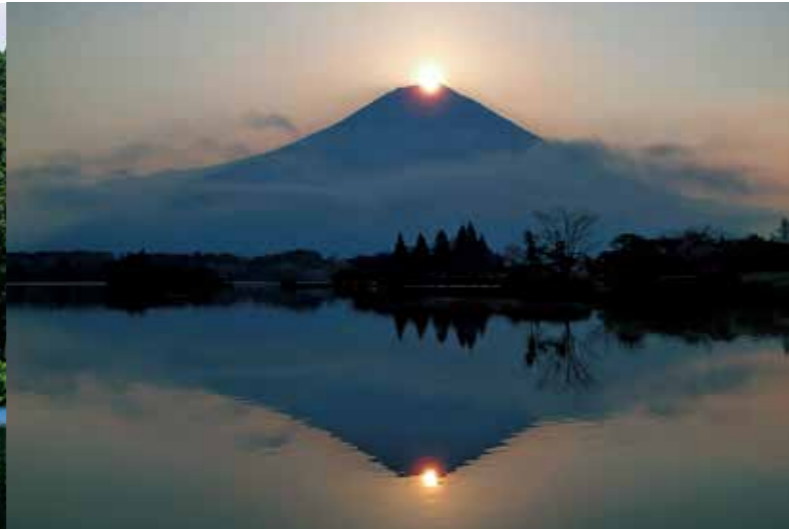
064 Lake Tanuki [Tanukiko] (Fujinomiya City, Shizuoka Prefecture)