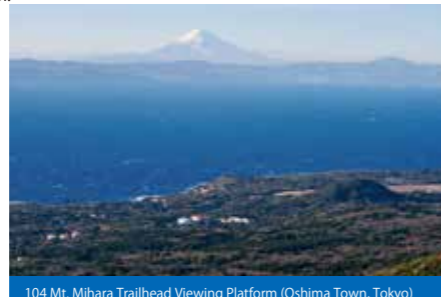
104 Mt. Mihara Trailhead Viewing Platform (Oshima Town, Tokyo)