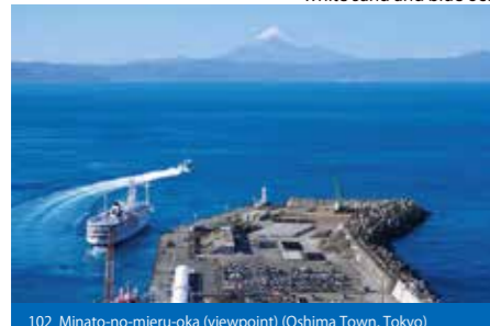
102 Minato-no-mieru-oka (viewpoint) (Oshima Town, Tokyo)

The Izu Islands are islands interspersed in the Pacific Ocean, 120 to 290 km south of Tokyo. In this area, you can enjoy characteristic landscapes of each island, for example, volcanic landforms produced by old and new lava and the beautiful contrast between white sand and blue ocean.