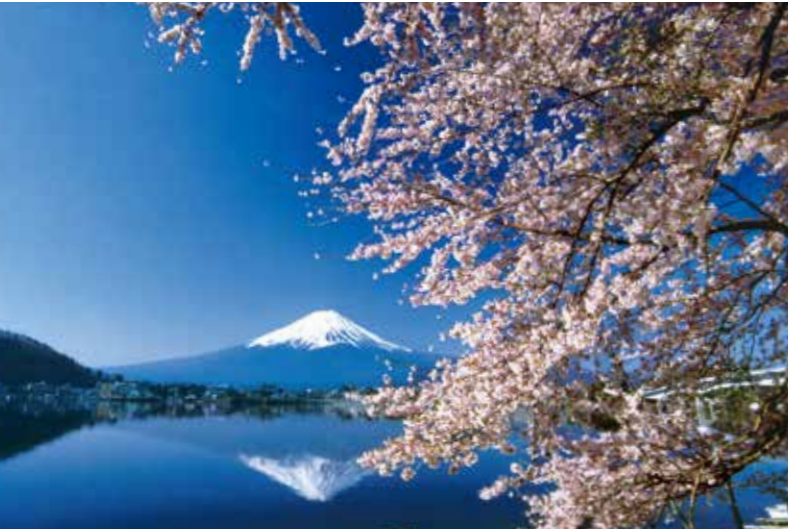
046 Cape Ubuya [Ubuyagasaki] (Fujikawaguchiko Town, Yamanashi Prefecture)