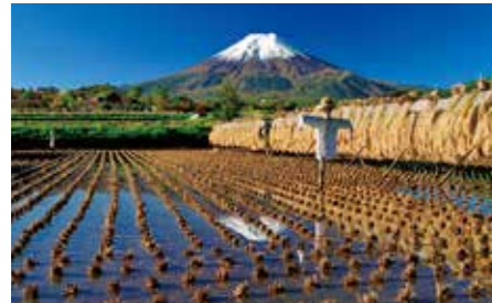
014 Shiroshima-higashi Nōson Park (farming village) (Fujiyoshida City, Yamanashi Prefecture)

Mt. Fuji is a World Cultural Heritage site known for its proportioned beauty. The lava flows from volcanoes have created varied natural models, such as, the Fuji Five Lakes, the vast Aokigahara Jukai Forest, wind caves, ice caves, and lava tree molds like wooden casts.